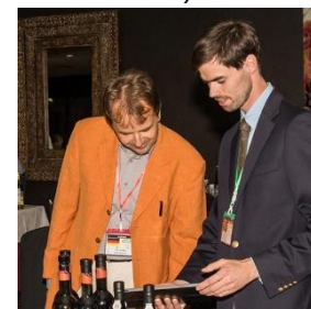
Previous years events